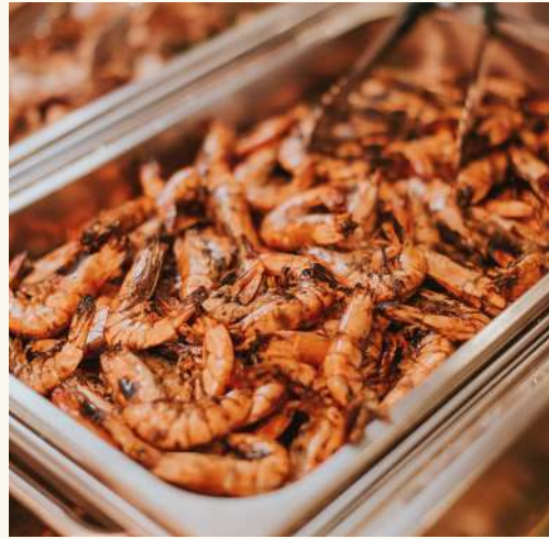
Grilled Tiger Prawns