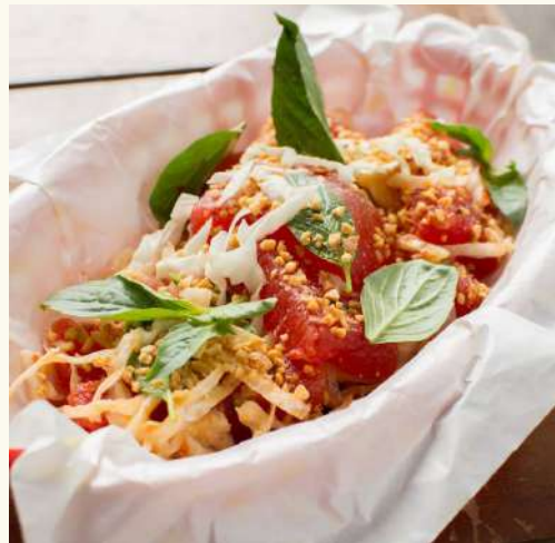
Thai Watermelon Salad